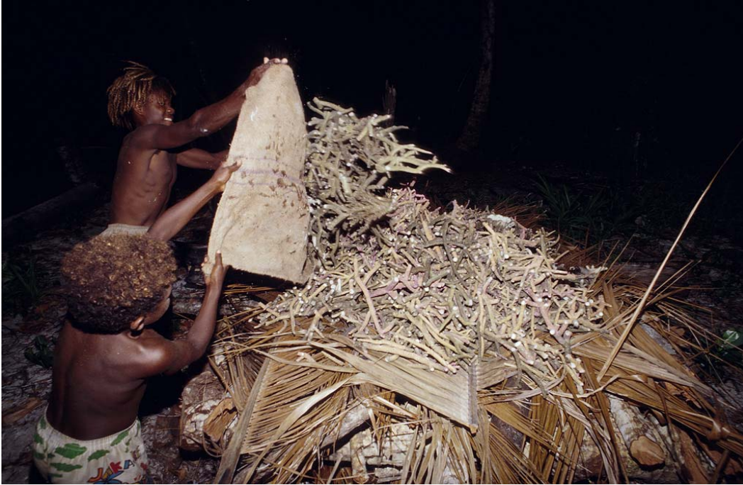
Figure 3. Nggela boys about to burn coral for making lime (Nggela, Solomon Islands, 1995).

Do coastal Melanesians believe coral to be living or inanimate? The most common term in the lingua franca for “coral” in both PNG and Solomon Islands is Ston (literally: “stone”), which obviously implies that is not alive. However, people do notice that corals grow, though they mostly do not think of this growth as analogous to the growth of plants. However, many stones, including (non-coral) stones that lie underwater, are believed to possess magical qualities, and can move around, attack boats, grow or transform in various ways. Indeed the sea is full of magical, dangerous and mysterious creatures and spirits in most coastal Melanesian cosmologies (Macintyre 1983, Macintyre and Foale, in press) In PNG, people notice that corals can be “spoiled” (i.e. become covered in plant growth) if they are covered by sediment, or damaged by dynamite fishing for example. People who make lime from branching corals use only living coral branches and avoid dead ones that have algae growing on them, as the latter produce poor quality lime.