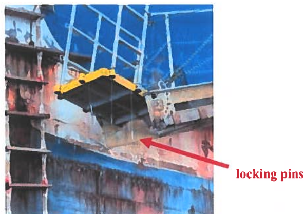
Fig. 3: Accommodation ladder with unsecured locking pins.

In a separate incident that occurred on January 3 rd , 2022 a vessel pilot attempted to board foreign flagged vessel via an accommodation ladder and noticed that the locking pins used to secure the railings to the ladder were not in place.