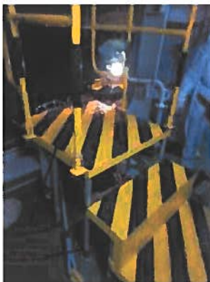
Fig. 1: Pilot boarding platform

The vessel's pilot boarding area housed a platform approximately two and a half feet tall for accessing the Jacob's ladder. A locking pin that would normally secure the platform to the deck was loose due to improper installation. When the pilot stepped over the side of the vessel to climb down the Jacob's ladder, the loose locking pin gave way and caused the platform and pilot to fall into the water.