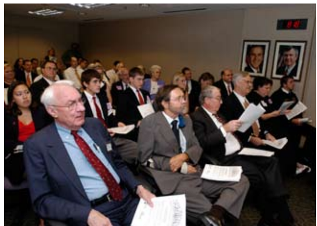
Visitors and special guests attend the secretary's briefing for the July Crop Production report to recognize 100 years of secure agricultural statistics.