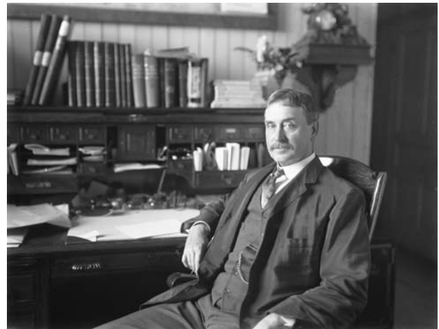
Bureau of Statistics Chief Victor H. Olmsted (1910).

The previous paragraphs illustrate that many physical security procedures used today were in place in the early 1900s. There were slight shifts in the procedures for Crop Reporting Board make-up in the first few years after 1905. Some of those