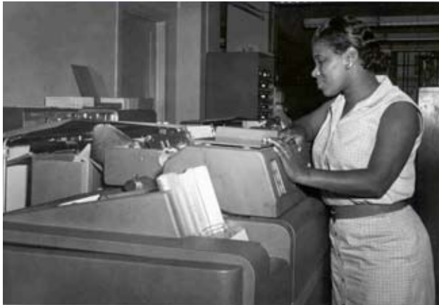
An IBM machine.

By 1964 the Agency had completed testing and had increased area frame sample sizes to operational levels for the 48 contiguous states. The process completely changed operations in the state offices since they needed to hire and train part-time enumerators for the June and December area frame surveys and for objective yield surveys in those states with significant acreages. Because area frame sampling works best for major crops, the traditional mail surveys were continued to provide indications for all crops and for county estimates at the end of the season.