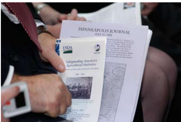
Attendees at the celebration received handouts with historical information and photographs documenting the past 100 years of the Agricultural Statistics Board.