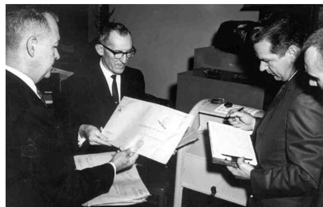
USDA officials record receipt of the envelopes as soon as they are retrieved from the locked safe.

Because photocopies were not feasible, the Agency had to mail original documents back and