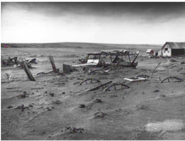
Drought conditions and blowing soil buried machinery on a farm in South Dakota in May 1936.

To control supplies in 1934 and 1935, producers were offered favorable loans for reducing production. This required county-level information on usual corn acreages, potential corn yields per acre, and usual production of hogs. The Division of Crop and Livestock Estimates was called upon to analyze all available data and to create the necessary county estimates. Ninety-two junior statisticians were hired for state offices to handle the added workload, one of the largest staffing increases ever for USDA statistics. The CRB did not meet to approve all new county estimates but did issue instructions to be followed in creating them.