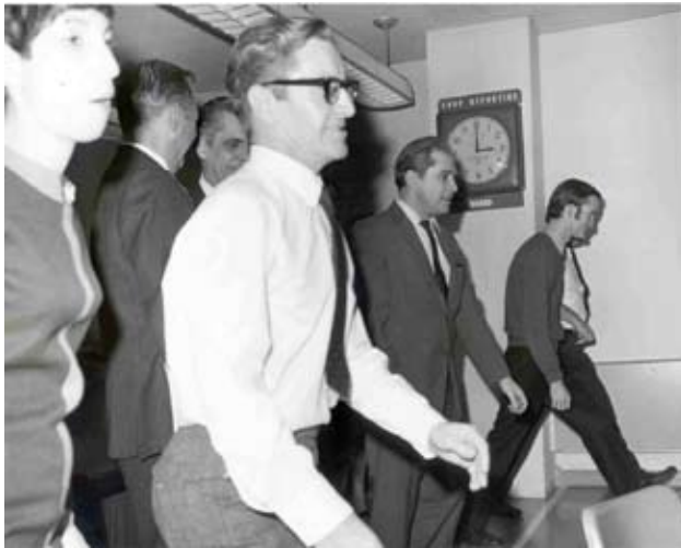
Reporters in the press room anxiously cross the line to retrieve copies of a report once the official Crop Reporting Board clock strikes 3 p.m.

In 1986 the CRB was renamed the Agricultural Statistics Board (ASB). This renaming coincided with the renaming of the agency as the National Agricultural Statistics Service. Years later, in May 1994, one of the most significant changes in ASB delivery of statistical reports occurred when the release of major crop-related reports shifted from 3 p.m. to 8:30 a.m. Lockup periods for some of those reports now started before midnight in order to enable the Board to complete all analysis and publication operations.