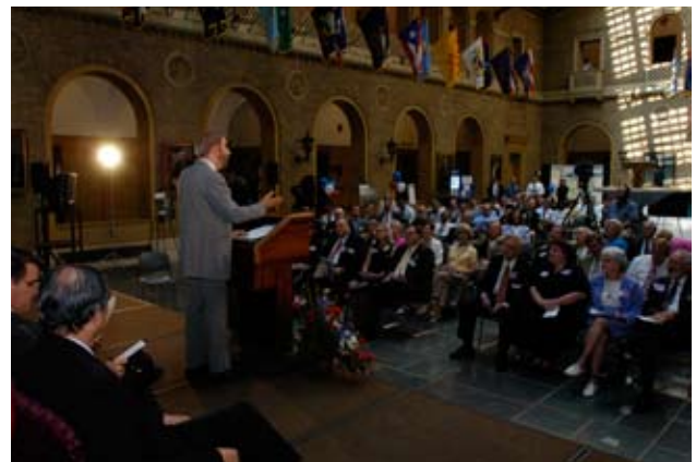
The patio in the USDA Whitten Building provided the perfect background for this historical occasion.