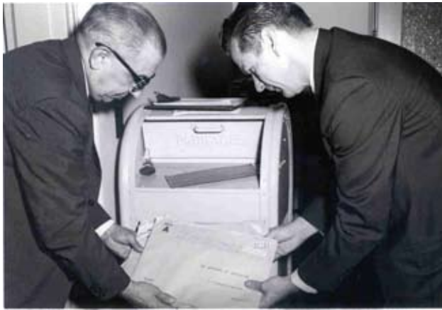
USDA officials retrieve the “Special A” envelopes containing summaries and recommendations sent from State and Field Agents to USDA headquarters in Washington, D.C.