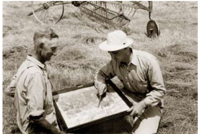
A USDA official reviews an area frame map with a farmer in Arkansas, 1951.

Project A called for the implementation of area frame-based probability estimates for crop acreages through interviews of producers on randomly selected segments of land. It also proposed to improve yield forecasts and estimates by selecting random fields from the area frame survey and making field counts and measurements during the