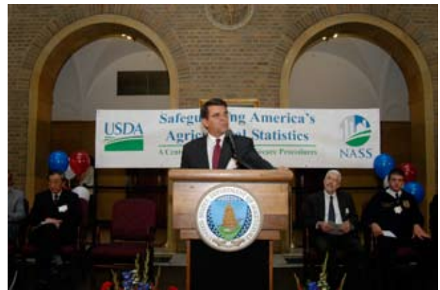
USDA Deputy Secretary Charles Conner addressed the audience by emphasizing how vital agricultural statistics and ASB reports are to the U.S. agricultural community.