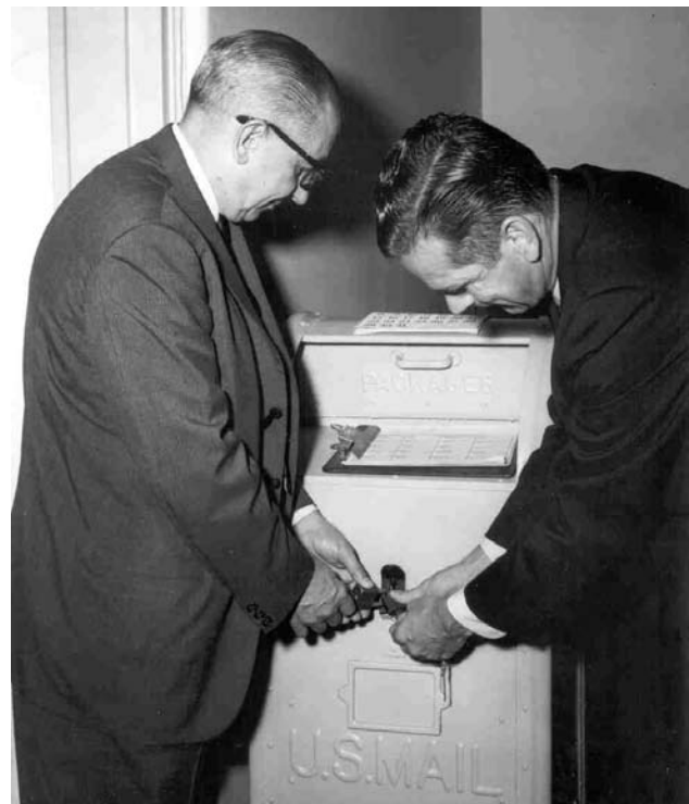
USDA officials unlock the safe/mailbox. Two sets of keys were required to unlock the dual locks to ensure the reports were kept secure.

If sources of information for a particular report did not closely agree, weight was given to historical performance of indications from each of the sources.