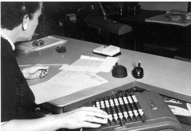
An official uses a comptometer to assist with the computations and tabulations for the June 1947 crop report.

Most processes today are automated for state offices, as well as for the Agricultural Statistics Board (ASB), formerly known as CRB. Current indications are brought into the comparison table spread sheets and the adjusted indications are visible on the computer screen. Most NASS systems