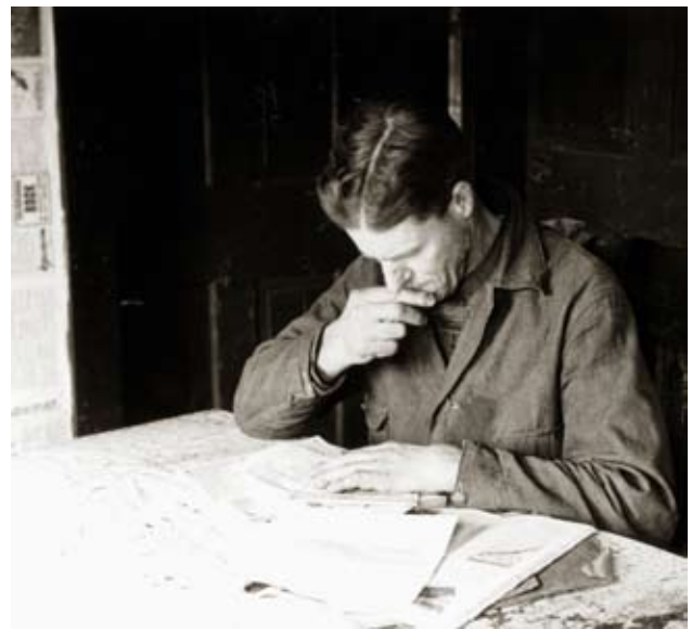
A farmer reviews his accounts in April 1936.

By the end of the 1920s – a more detailed livestock statistics program was in place. Monthly egg and milk production were estimated, along with periodic information on hog production and lamb production. All estimates were at the state and national level only. However, this would change as the country dealt with the severe economic conditions of the Great Depression. Money was extremely tight and prices of agricultural commodities were at very low levels. In 1933 there was also the possibility of producing surpluses, which would drive prices even lower. In May of 1933, Congress passed the Agricultural Adjustment Act that established the Agricultural Adjustment Administration (AAA) to develop programs to balance out supplies of agricultural products and to improve commodity prices.