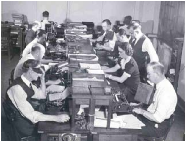
From the Telegraph Room in the USDA South Building, the Crop Report is sent to all parts of the world.

Even in the early 1900s, due care was taken to inform all interested parties as uniformly as possible. Reports related to cotton were released on the 3rd of the month at noon during the growing season. Reports on other principal farm crops and livestock were released on the 10th of the month at 4 p.m. Reports were handed to all interested parties who attended and to the Western Union Telegraph and the Postal Telegraph Cable companies for transmission to the press and to commodity exchanges. A short, mimeographed report containing narratives and data tables, which included previous estimates and final production figures, was sent to a mailing list of press, exchanges, and individuals that same day. A printed card with the report details was mailed to all 77,000 post offices in the United States for public display. Details of all reports released during a month were included in the 8-page monthly (except for February) Crop Reporter, which had a circulation list of more than 100,000 correspondents and other interested parties.