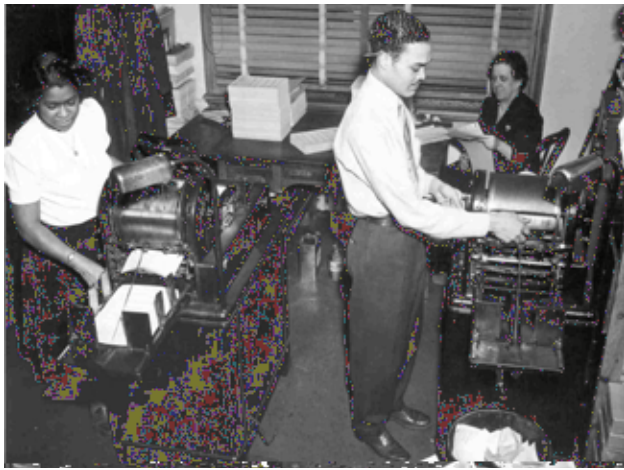
Staff prepare “release copies” of the June 1947 crop report on mimeograph machines set up inside the lockup area.

A time series, or comparison table, approach created data arrays of indications and final estimates for past data periods (usually 10 or more). The difference (either absolute or percentage, depending on the type of data item) was calculated and displayed for each time period, along with the average difference. Adding the average difference to the current survey indication provided a recommendation for each data source. Analysts could also see the impact of unusual years in the data set and adjust their conclusions, if necessary.