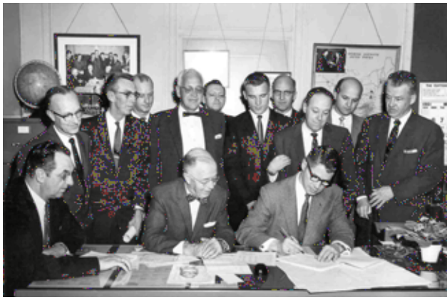
A USDA official signs a report.

Briefings for the Secretary have also changed tremendously over the past 100 years. There are some interesting historical pictures of CRB members crowded around a desk while the Chairperson highlights the report details for the Secretary. Presently, the briefing is more formal, with data tables and results projected on a screen and the Secretary is able to leave the briefing with a full-color set of the briefing materials as well as the report(s). WAS-DE briefings often contain some satellite images depicting current vegetative indexes or summaries of rainfall in major producing regions around the world. Visitors attend most briefings. Many of the visitors are producers or members of farm organizations. The earliest identified farm groups were from North Carolina in the late 1970s. However, a delegation from the Illinois Farm Bureau attended the August 1982 Crop Production release and that organization has sent a new group to visit every August since. Other producer organizations have followed suit in planning occasional visits.