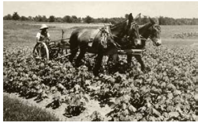
A farmer cultivates cotton on a farm during the Dust Bowl. CRB members were required to be familiar with techniques used to produce cotton.

The classic case of the impact of specific cotton legislation on the operations of the Agency was the cotton crop reports law enacted on May 3, 1924. The law (codified as 7 USC Sec. 475) had many facets, such as specifying release of USDA re-