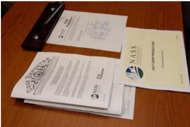
In honor of the centennial celebration, the July 12 crop report was printed with a Crop Reporter header similar to what was used in 1905.