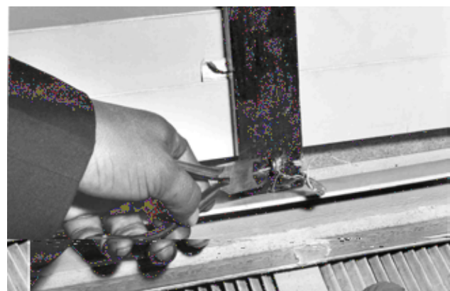
USDA officer closes and seals the window blinds to maintain security.

Since Hyde had already instituted a locked door policy for the detailed review of the various indications, it appears that Hays’ contributions were first to define the rotational Board approach and second to be sure the curtains were drawn, and any additional physical security measures employed, while the Board deliberated up to the release time.