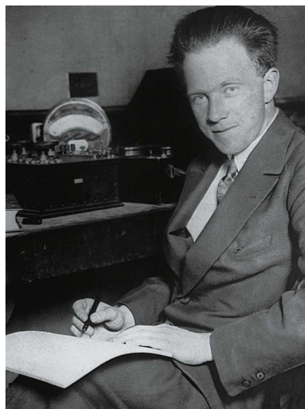
Werner Heisenberg, pictured in 1925.

By the time of the 1927 Solvay Conference, most physicists felt that quantum mechanics had reached a provisional conclusion. In their report, Heisenberg and Born declared quantum mechanics to be a “complete theory, whose fundamental physical and mathematical assumptions are no longer susceptible to modification”. Others were less convinced.