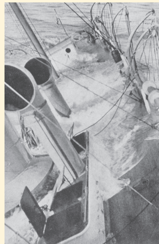
Wreck of U.S. Revenue Cutter TAHOMA which struck an uncharted pinnacle rock off Agattu Island, western Aleutians, September 20, 1914.

Here's a chance to try your hand at coastal navigation using a modern nautical chart. Watch out for shoals!