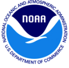
Table of Figures