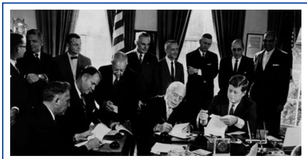
Figure 1. President Kennedy and the Basin State Governors Sign Ceremonial Compact Documents at the White House on November 2, 1961. Seated (from left to right) are New Jersey Governor Robert Meyner, Delaware Governor Elbert Carvel, Pennsylvania Governor David Lawrence, and President Kennedy.

We are glad to join with Delaware, New Jersey, New York, and Pennsylvania in this bold venture. The task set for the Commission will not be easy to achieve, but we are confident that the cooperation that has brought forth this Compact will endure, and that working together real progress can be made for the people of the Basin. ... President John F. Kennedy, November 2, 1961.