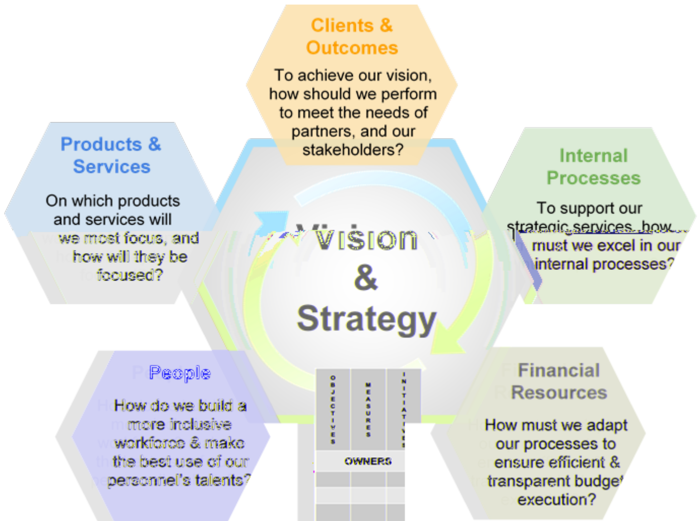
Figure 4. The AKR scorecard tracks objective measures and initiative along the five perspective