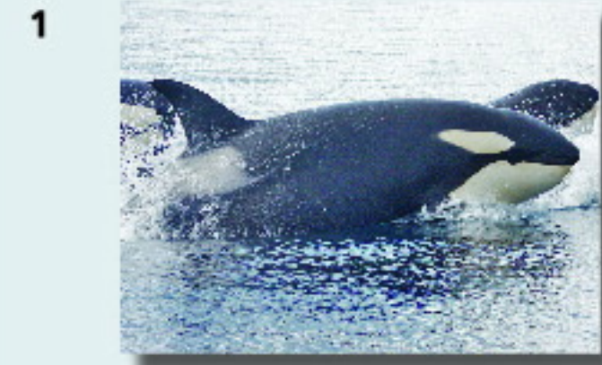
1 Antarctic Type A Killer Whale

A large (perhaps to 9.5 m/31 ft.), black and white form; it migrates to Antarctica during the austral (southern) summer where it forages in open (ice free) waters and feeds mainly on minke whales and occasionally elephant seals. During the winter, it probably migrates to lower latitudes, perhaps to the tropics.