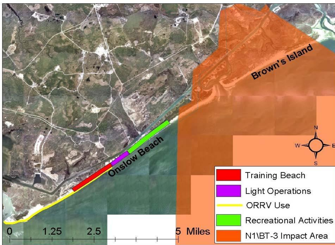
Figure 1. Map of Onslow Beach showing training recreational and special use areas.