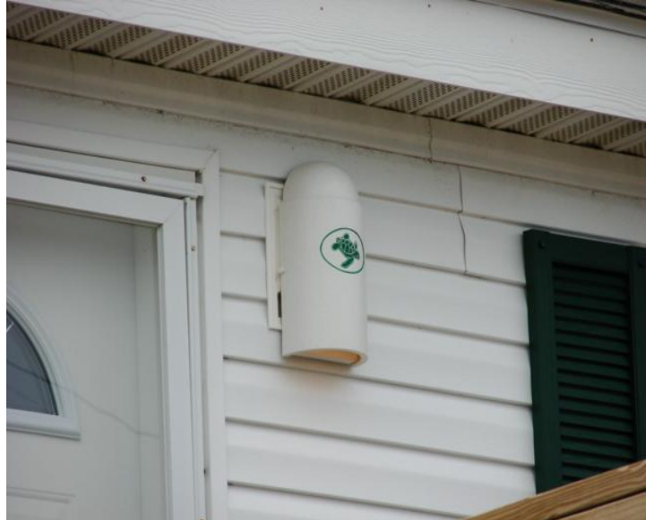
Figure 2. Onslow Beach housing unit showing canister lighting.