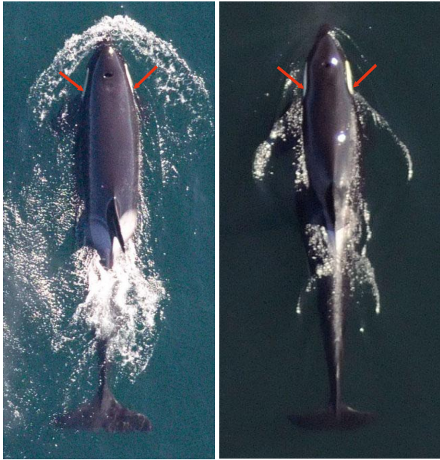
Fig. 1. K13, a robust 41.5 yr old female Orcinus orca (left) and L67, an emaciated 23.5 yr old female that subsequently died (right). Arrows show where head width (HW) measurement was taken at 15% of the distance between the blowhole and anterior insertion of the dorsal fin (BHDF). Note that the white eye patches of K13 angle outward towards the posterior, while the eye patches of L67 angle inward and follow the shape of the skull

ance (see our Fig. 1; Pettis et al. 2004, Bradford et al. 2012, Joblon et al. 2014). We used HW as a proportion of the BHDF as an index of nutritional status; both were measured in pixels and were required to be taken from the same image. For all metrics, we required a minimum of at least 3 estimates to include an individual in the subsequent data analyses.