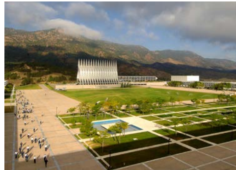
U.S. Air Force Academy in Colorado Springs, Colorado.

We are working with the U.S. Air Force Academy in Colorado Springs, Colorado, to provide a conceptual microgrid design for its campus. Findings indicate the microgrid system may include a combined heat and power system in addition to energy storage and photovoltaics for this sunny location.