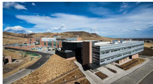
Energy Systems Integration Facility at the National Renewable Energy Laboratory in Golden, Colorado. Photo by Dennis Schroeder, NREL 23402

For more information about the ESIF, visit www.nrel.gov/esi/esif.html .