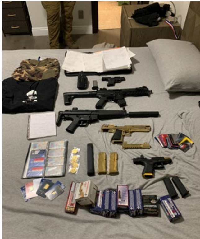
During the execution of a UI fraud search warrant, OIG agents recovered multiple firearms, UI debit cards, and notebooks containing personally identifiable information.

As of January 2023, our pandemic investigations have resulted in upwards of 700 search warrants executed and over 1,200 individuals charged with crimes related to UI fraud. These charges resulted in more than: 500 convictions; 11,000 months of incarceration; and $905 million in investigative monetary results. We have also referred over 23,000 fraud matters that do not meet federal prosecution guidelines back to the states for further action.