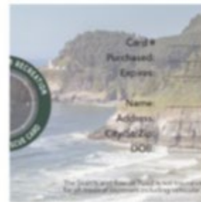
ORSAR 1-Year Card ORSAR 1-Year Card (Oregon Coast Heceta Head Lighthouse) $10.00