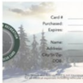
ORSAR 1-Year Card ORSAR 1-Year Card (Central Snowy Trees) $10.00