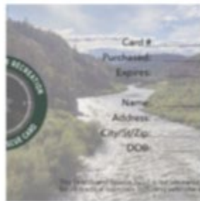
ORSAR 1-Year Card ORSAR 1-Year Card (Josephine) $10.00