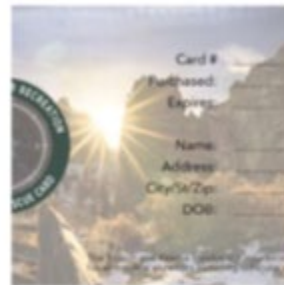
ORSAR 1-Year Card ORSAR 1-Year Card (Deschutes Smith Rock) $10.00