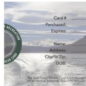
ORSAR 1-Year Card ORSAR 1-Year Card (Jefferson Co Boat) $10.00