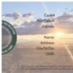
ORSAR 1-Year Card ORSAR 1-Year Card (Jefferson Co Mountain Sun) $10.00