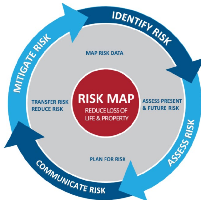
Figure 2. Risk MAP Vision

The intent for Risk MAP is to combine flood hazard mapping, risk assessment tools, and hazard mitigation planning into one seamless program. FEMA’s overall vision through Risk MAP is to work collectively with state, local, and tribal entities to deliver quality data that increases public awareness and leads to action that reduces risk to life and property.