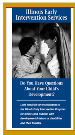
example from Illinois

The public awareness program requires the lead agency to: