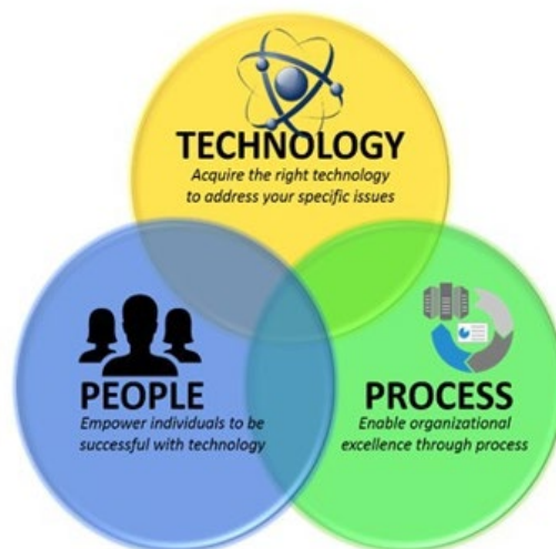
Figure 2 Figure 2: IT Core Elements Diagram

Our Concept is based on the basic premise that an organization has three core elements, people, process, and technology that are responsible for its success or failure. Figure 2 illustrates our concept and the correlation of the three core elements. Within each of the core elements specific objectives and/or performance expectations will be identified.