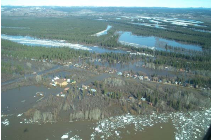
Photo 1: Koyukuk just before the runway was inundated, May 26, 2001 flood.