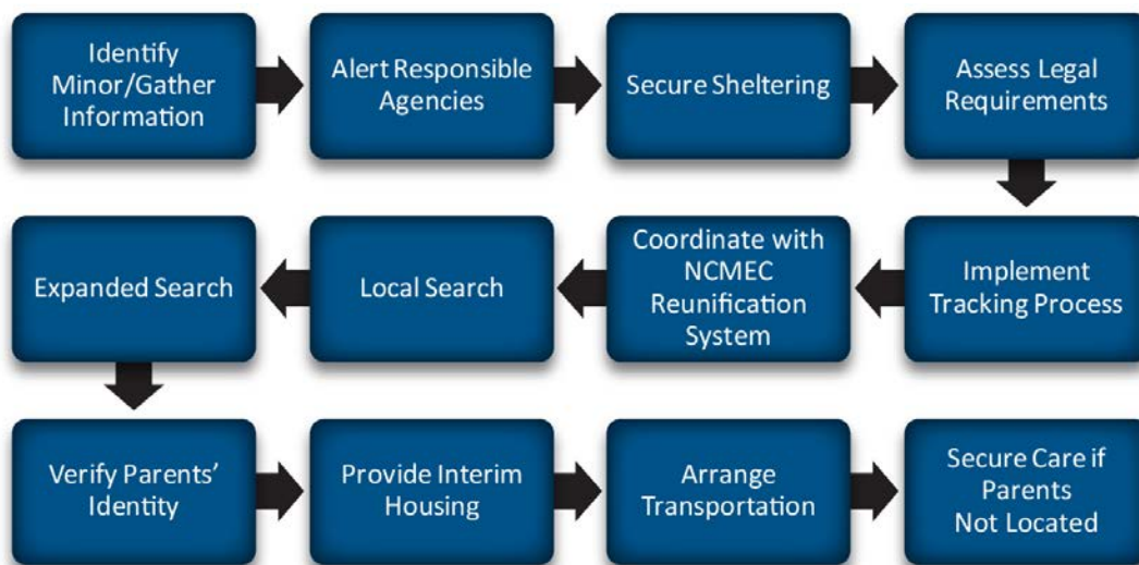
Figure 1: Minor Separated from Parent or Legal Guardian

If a child is discovered as having been separated from his or her parents, legal guardians, or other relatives and is not being cared for by an adult who is legally responsible for doing so, that child is considered to be an unaccompanied minor. Upon discovery of an unaccompanied minor, agencies responsible for the temporary care of displaced minors may begin to work through the following steps to support the child while he or she is separated from his or her parent or legal guardian and to reunite the child with his or her parent or legal guardian.