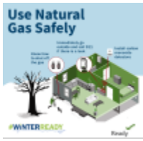
Use Natural Gas Safety (Square) Download Graphic