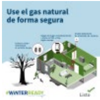
Use Natural Gas Safety (Spanish)(Square) Download Graphic