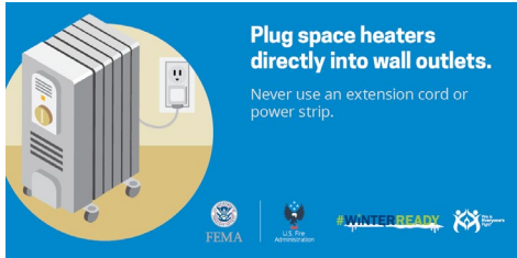
Plug Space Heaters into Wall Outlets Spanish