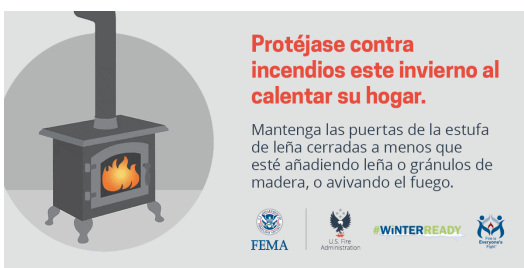
Wood Stove Stay Fire Safe This Winter gif Spanish .