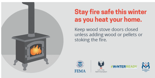
Wood Stove Stay Fire Safe This Winter gif English