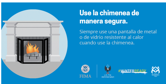
Use Your Fireplace Safely gif Spanish .