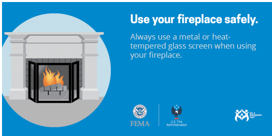
Use Your Fireplace Safely gif English