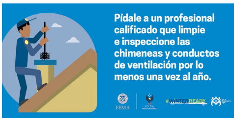
Have Chimneys And Vents Inspected gif Spanish