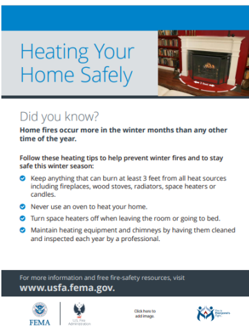
Home Heating Safety flyer English