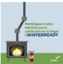
Stay Safe When Heating Your Home (Spanish)(Square) Download Graphic