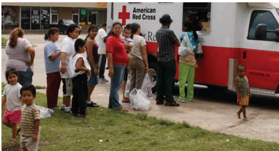
Individuals and families line up before a Red Cross emergency response vehicle for meals and bottled water in Wallisville, Texas, after Hurricane Ike knocked out power to their neighborhood.

On June 1, the Red Cross marked the beginning of hurricane season 2008. It proved to be one of the most destructive and costliest hurricane seasons in U.S. history.