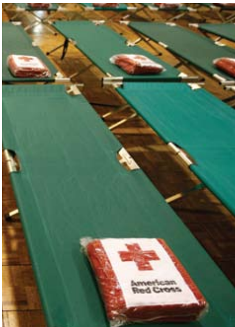
As residents started to evacuate Mississippi ahead of Hurricane Gustav, Red Cross shelters awaited them.

As soon as the area is safe for entry, the Red Cross circulates through disaster-affected neighborhoods, identifying needs and delivering food, supplies and information to residents planning their recovery. In most cases, we can provide nearly a million meals per day within 72 hours, thanks to the hard work of Red Cross disaster workers and our partners. Often, the Southern Baptist