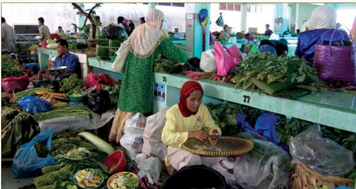
Food markets, like this one in Aceh, are being built with the support of the American Red Cross and Community, Habitat and Finance International.

Local markets have long been community focal points throughout Aceh province, serving as centers of small-scale economic activity. In partnership with the organization Community, Habitat and Finance International, the American Red Cross is assisting in the revitalization of small businesses in Aceh. This project, expected to benefit approximately 103,000 vendors and buyers, is rehabilitating and rebuilding market stalls in 16 communities and distributing 900 grants to small businesses and local entrepreneurs.