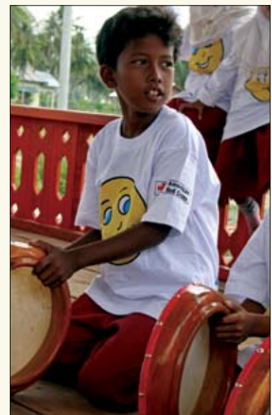
Making music is one way psychosocial programs help children heal.