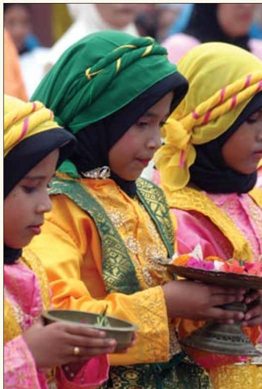
Girls participate in a traditional ceremony in Aceh, Indonesia.