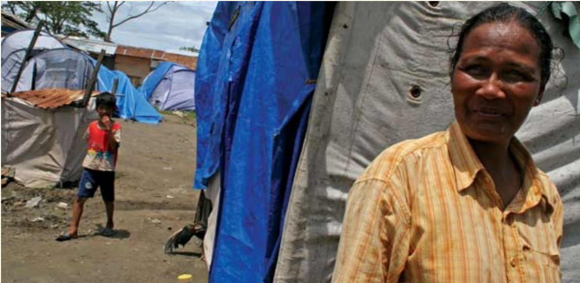
Many people in Indonesia still need critical assistance.

The tsunami affected the environment in many ways as well. Mangrove forests that kept coastal ecosystems in balance and protected much of the coastline from cyclones and storms were destroyed. Construction needs strain forest resources. Fisheries, an important industry in all tsunami-affected areas, must be managed to avoid depletion of resources. In all its programs, the American Red Cross works to protect the environment, provide sustainable livelihoods options and build a brighter future for all.