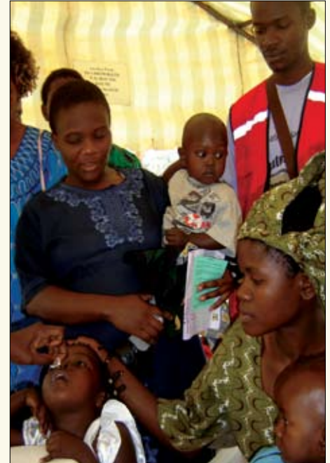
A Kenyan girl receives vitamin A drops during an integrated health campaign to help strengthen her resistance to disease.