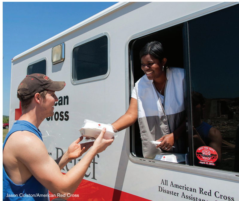
Jason Colston/American Red Cross

A month later in Orland, Calif., the Red Cross provided shelter and emotional support to survivors of a charter bus crash that took 10 lives. We also set up a hotline so affected families could request emergency assistance, such as travel or transportation expenses and additional mental health support and counseling.