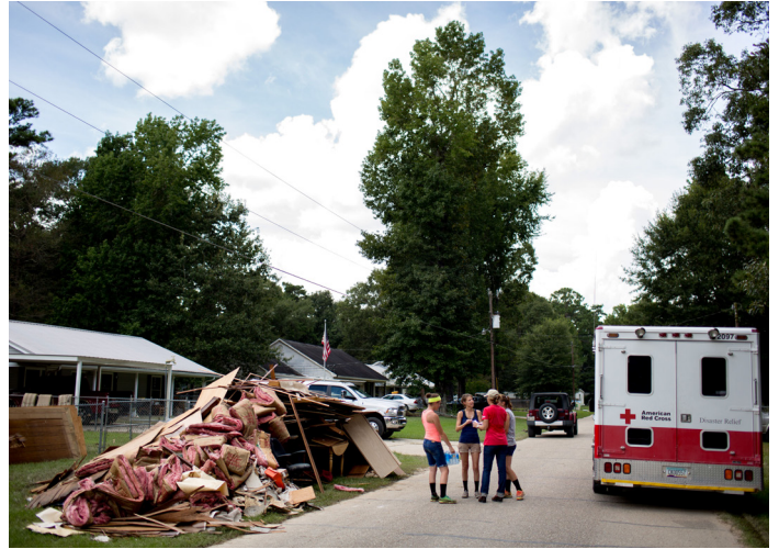
Across southern Louisiana, the Red Cross is helping thousands of people who are starting the long cleanup process.

Estimates show our relief effort could cost $25 million to $30 million. As of Sept. 13, we've received nearly $23