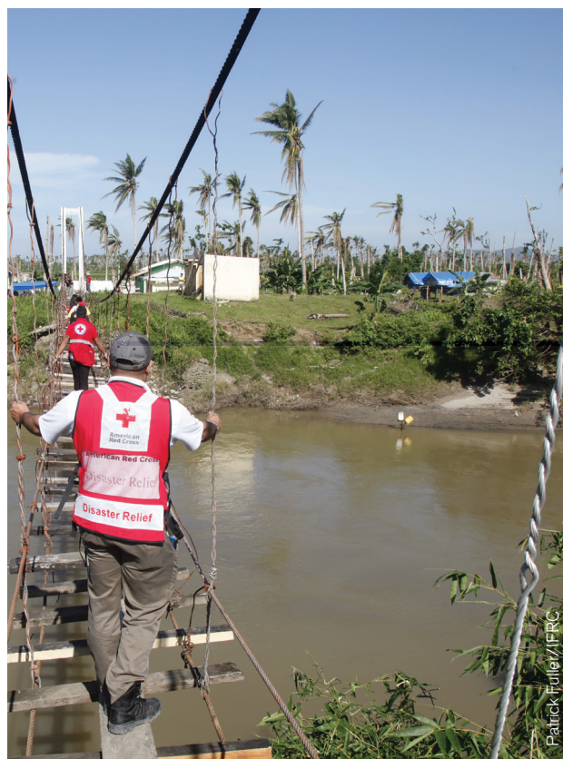
American Red Cross and Philippine Red Cross volunteers cross the typhoon-damaged footbridge to Balud, Tanuan, for an emergency cash distribution. The American Red Cross later provided construction materials for the residents of Balud to repair and shore up the bridge, making it safer for delivery of heavy relief supplies.