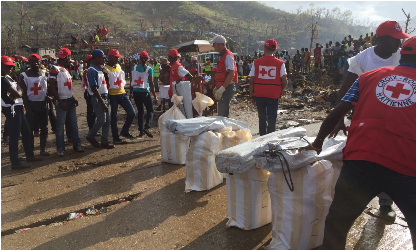
Haitian Red Cross staff and volunteers partner with the International Federation of Red Cross and Red Crescent Societies (IFRC) to distribute relief supplies at the port of Anse d’Hainault, not far from where Matthew made landfall.

Meanwhile, more than 2,000 remote mapping volunteers from around the world helped make more than 2.5 million edits to OpenStreetMap for Haiti. These updates connect Red Cross field teams with important information about damage to buildings and roads, and help relief teams on the ground identify and reach affected communities.