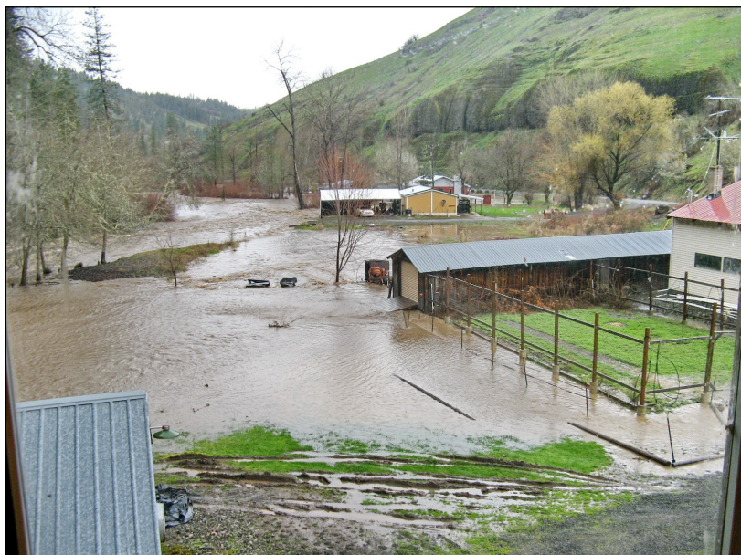
In early April, severe flooding caused widespread damage in Idaho and Lewis counties, triggering mudslides and filling homes with water. The Red Cross and its partners continue to provide relief.

FUN FACT: I have received the Boy Scout leaders highest award, The Silver Beaver.