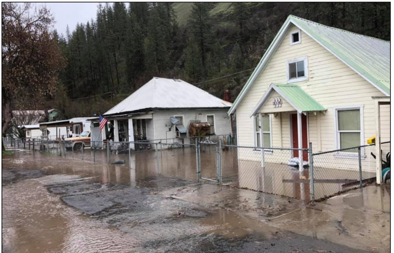
Teams went door-to-door in April, walking three miles in one day to check on people and asking what they could do to help.