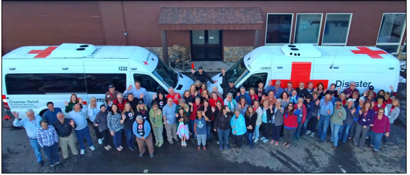
More than 100 volunteers attended the Training Institute, laughing and learning along the way.