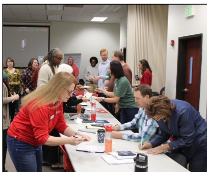
LEFT: Red Cross volunteers and Go Team Therapy dogs were a hit at a Trunk or Treat event at the Boise VA. ABOVE: Staff dives into some teambuilding fun at our annual retreat.