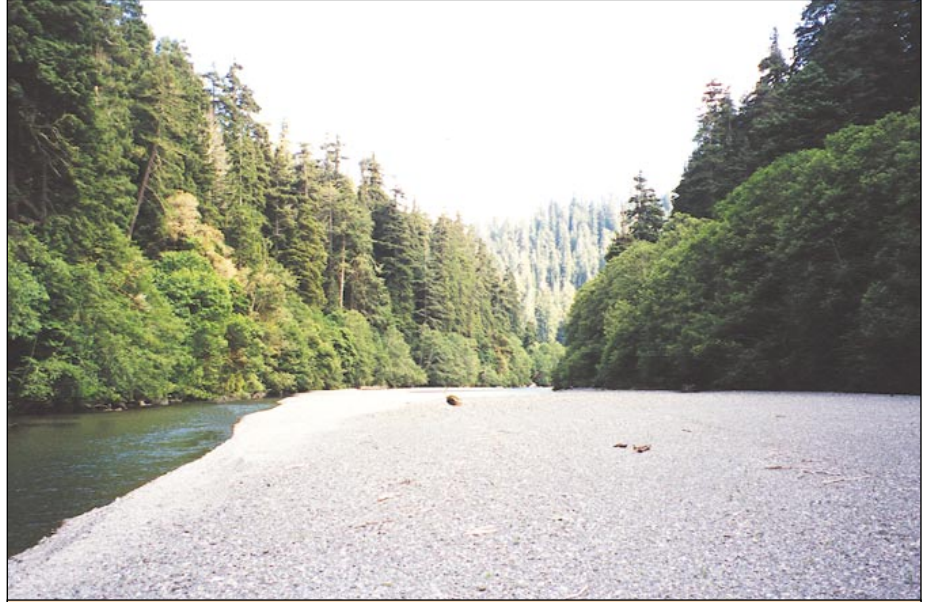
Lush vegetation and abundant fish habitat characterize much of Redwood Creek.

Our story explores the stream sedimentation processes and strength of the Redwood Creek salmonid populations, which have fluctuated over time. Over the years, archaic or partial data and unsupported opinion have influenced many perceptions concerning Redwood Creek; these misconceptions have, unfortunately, continued up to the present day. To provide a new perspective and a scientific basis for re-examining existing policy, the authors of this document have gathered every piece of known data, reviewed all published reports, spoken to available historical eye witnesses, and