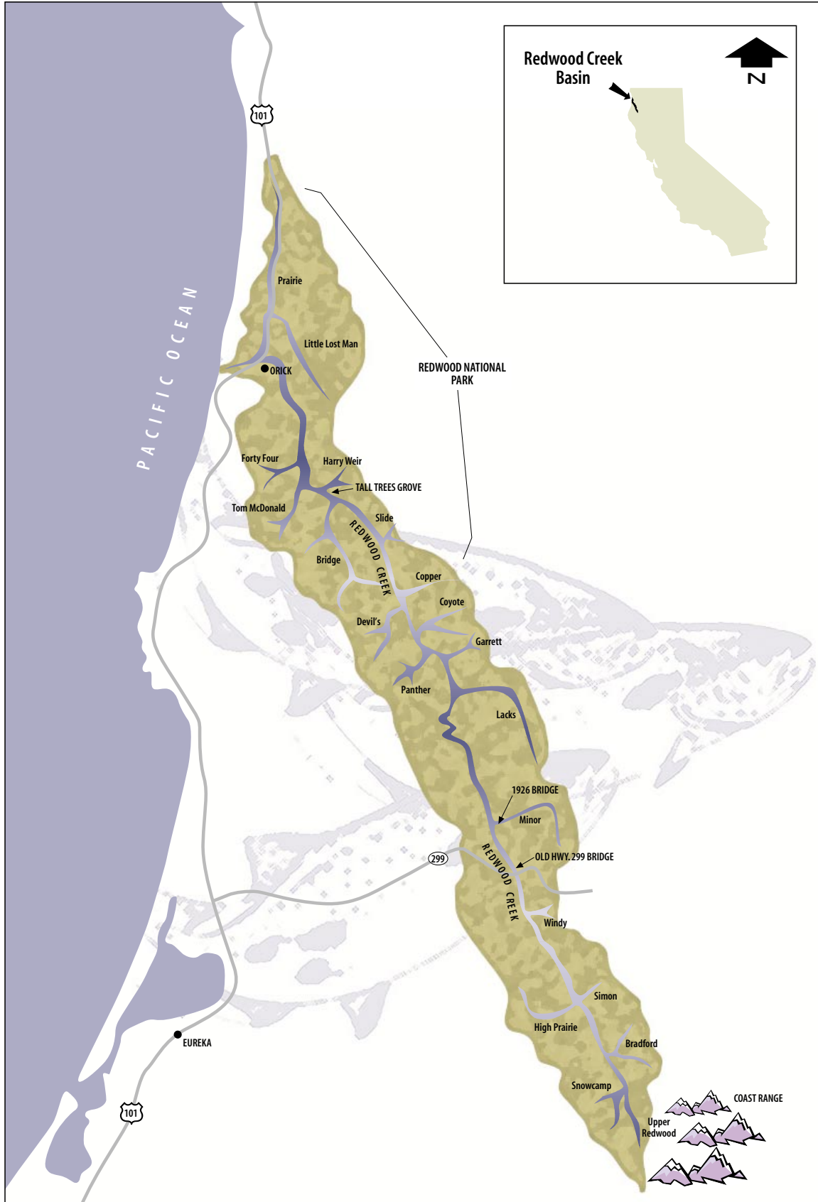
The tributaries of Redwood Creek flow toward Orick and the ocean.