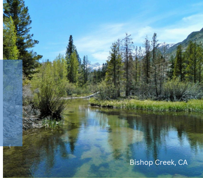
Bishop Creek, CA

Assistance from TXG offers reassurance that if any issues or queries emerge with this project, the WQCP team retains the option to seek assistance to address issues and learn in the process. TXG's support for tribal environmental programs in data management enables tribes to uphold their data sovereignty, preserving their independence in performing in-house data collection and analysis.