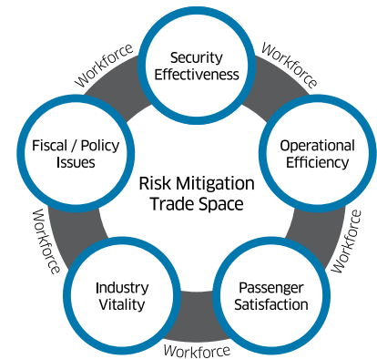
Figure 2: TSA's Trade Space Framework

By considering the impacts across the Trade Space, the agency can drive investment decisions based on a holistic review of identified key factors. To accomplish TSA's future vision, TSA, industry, and academic partners could invest in several capabilities to achieve the goals of the Trade Space framework.