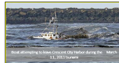
Boat attempting to leave Crescent City Harbor during the March 11, 2011 tsunami

If you do not have these essential preparedness items covered, DO NOT attempt to take your boat offshore. Secure your boat to the dock and leave the dock area before the tsunami arrives.