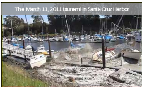
The March 11, 2011 tsunami in Santa Cruz Harbor

Prior to arrival of the March 11, 2011 tsunami along the California coast, many boat owners took their boats offshore without adequate supplies or knowledge of how long they would need to stay offshore.