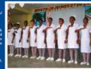
Students participating in a graduation ceremony.

I think Midwives for Haiti has a strong model and I would like to see the program replicated in other areas of Haiti. Estimates show that Haiti needs about 1,000 skilled birth attendants and it will take more than the twelve a year that we're able to train in Haiti. Ideally I'd like to see the program replicated in other developing countries with high rates of maternal and infant mortality.