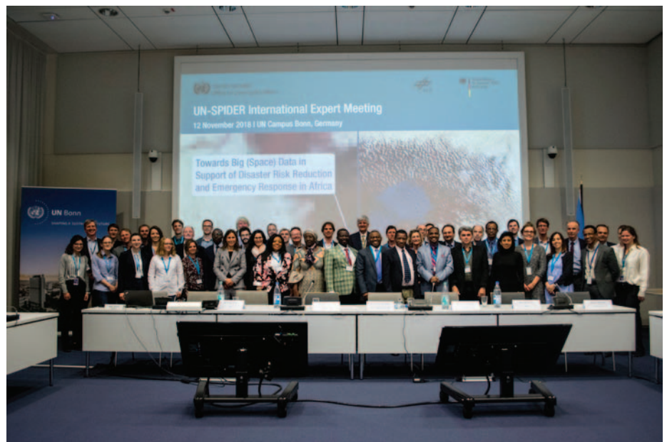
Participants from the space and disaster management communities at the UN-SPIDER International Expert Meeting "Towards Big (Space) Data in Support of Disaster Risk Reduction and Emergency Response in Africa".

In line with its mandate to facilitate access to all types of space-based information for the entire disaster management cycle, UN-SPIDER will continue to help disaster management agencies around the world take advantage of the information provided by these mechanisms to confront the challenges posed by natural and technological hazards.