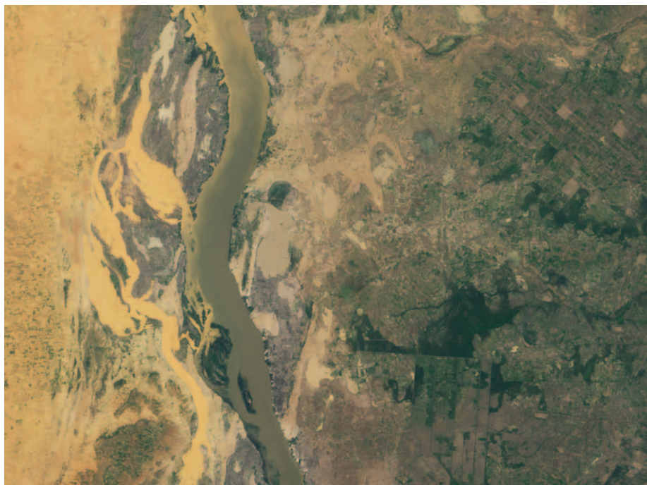
Flooded villages and farmland on the west bank of the White Nile in the Ad Douiem district of Sudan on 31 August 2019 captured by the Landsat 8 satellite.

help disaster relief operations, UN-SPIDER is striving to enable disaster management agencies in all countries to access, interpret and effectively use the data and information that satellites provide from several hundreds of kilometers above our heads.