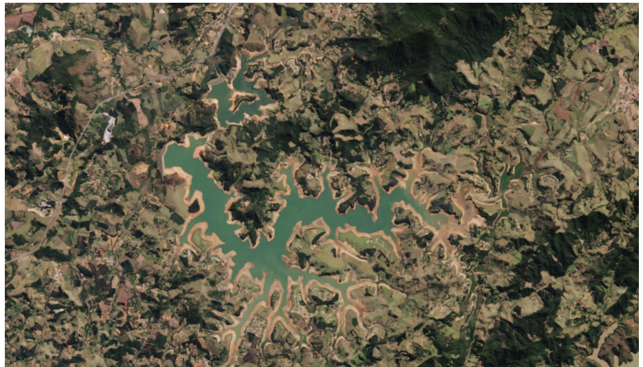
Drought and shrinking water levels in the Jaguari Reservoir, Brazil observed by the Landsat 8 satellite in August 2014

The Sendai Framework for Disaster Risk Reduction (2015-2030); a new