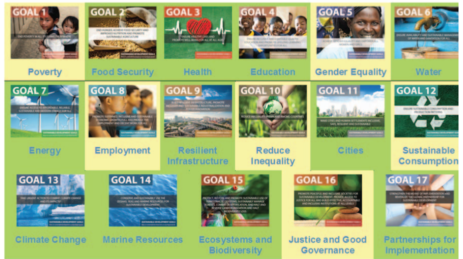
The application of space technologies to the 17 Sustainable Development Goals

Goal 2 aims at ending hunger and promoting sustainable agriculture. Satellite information can play an important role in addressing agricultural production challenges. Satellite navigation, satellite communication and Earth observation can support precision farming methods. These help farmers manage their resources and plan their seeding and harvesting periods more effectively as well as sell their produce according to up-to-date information on current prices and needs.