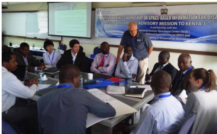
Discussion session at RCMRD during the Kenya TAM in March 2014

RCMRD values this partnership and looks forward to more engagements in the years to come including an expanded mandate to lead TAMs on behalf of UN-SPIDER in the region.