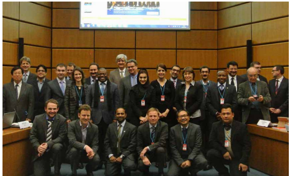
Participants of the fifth Regional Support Offices meeting in Vienna in March 2014

This network of RSOs is quite diverse. Some RSOs are national agencies, including space agencies, civil protection agencies, national geographic institutes or national research facilities or universities. Others are regional