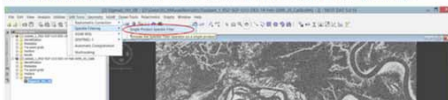
The recommended practice from Ukraine focuses on radar data for flood mapping

2.1 Next step is filtration. Select SAR Tools --> Speckle Filtering --> Single Product Speckle Filter.