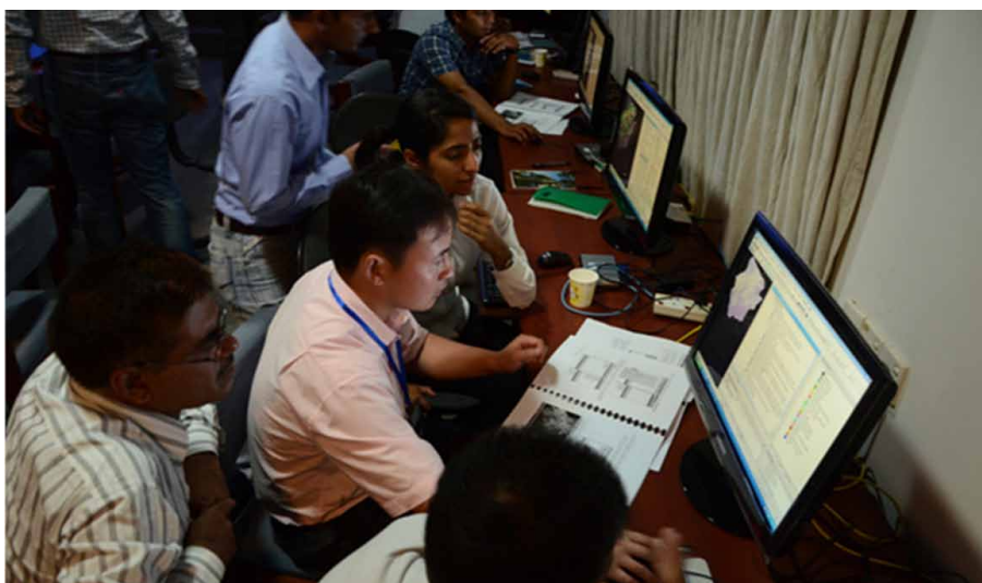
Participants experimenting with landslide detection/mapping algorithms

The participants furthermore learned about SERVIR-Himalaya, a NASA-backed mechanism for emergency response.