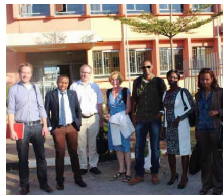
Zambia TAM team, May 2014

In 2013, the Centre participated in a TAM in Malawi. One of the outcomes of this TAM was the need to assist