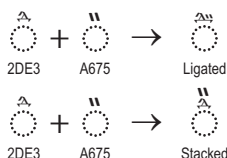
Figure 7-6. Combination of Titlo Letters

A wide variety of composite titlo letters can be encountered in Old Church Slavonic manuscripts, including such combinations as ghe-o , de-ie , de-i , de-o , de-uk , el-i , em-i , es-te , and many others. One of these combinations has been encoded atomically in Unicode as U+2DF5 COMBINING CYRILLIC LETTER ES-TE. However, the preferred representation of a composite titlo es-te is the sequence <U+2DED COMBINING CYRILLIC LETTER ES, U+2DEE COMBINING CYRILLIC LETTER TE>.