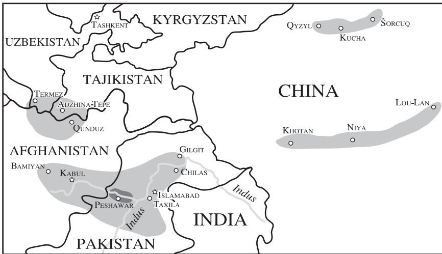
Figure 14-2. Geographical Extent of the Kharoshthi Script

The exact details of the origin of the Kharoshthi script remain obscure, but it is almost certainly related to Aramaic. The Kharoshthi script first appears in a fully developed form in the Aśokan inscriptions at Shahbazgarhi and Mansehra which have been dated to around 250 BCE. The script continued to be used in Gandhara and neighboring regions, sometimes alongside Brahmi, until around the third century CE, when it disappeared from its homeland. Kharoshthi was also used for official documents and epigraphs in the Central Asian cities of Khotan and Niya in the third and fourth centuries CE, and it appears to have survived in