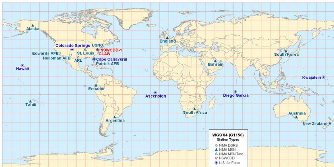
Figure 1: WGS 84 (G1150) Reference Frame Stations