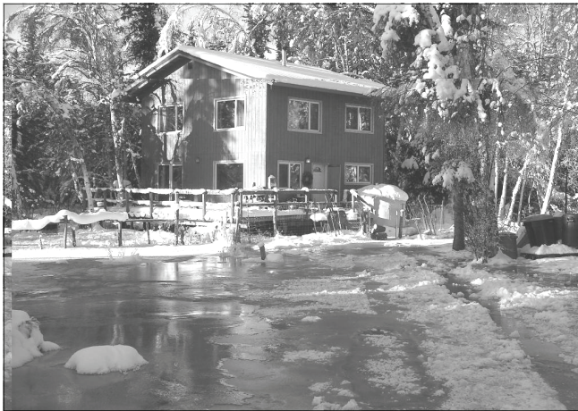
Overflow from Goldstream Creek surrounds a cabin near Fairbanks back in February

The cold and dry conditions resulted in considerable overflow icing of creeks and rivers during the winter. There were several reports of overflow inundating private property and causing groundwater levels to rise and dampen some home owners' crawl spaces. The excessive overflow ice has also kept the Department of Transportation busy trying to keep culverts thawed out and water from flowing over roadways. The abundance and thickness of ice on creeks and rivers does have some residents concerned that there may be a higher risk of ice jams during breakup. Fortunately the amount of water in the snowpack is low this year and the amount of runoff into the river systems will be much lower than normal.