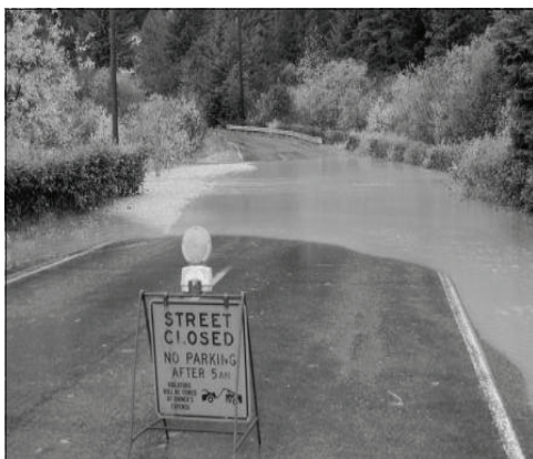
Heavy October rains caused flooding in the city of Seward