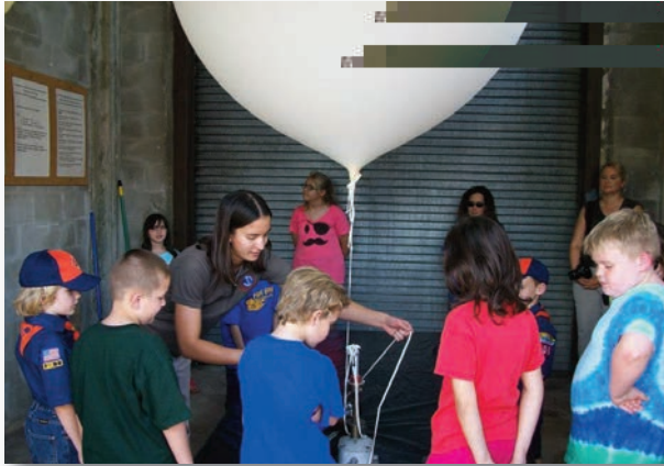
NOAA meteorologist teaches elementary school children about weather observation

WRN Ambassadors are change agents and leaders of their communities. You will inspire others to be better informed and prepared – helping to minimize or even avoid the impacts of natural disasters.