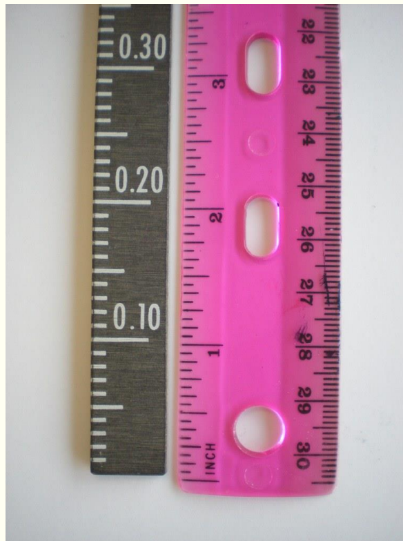
Measuring Stick is Calibrated 10:1