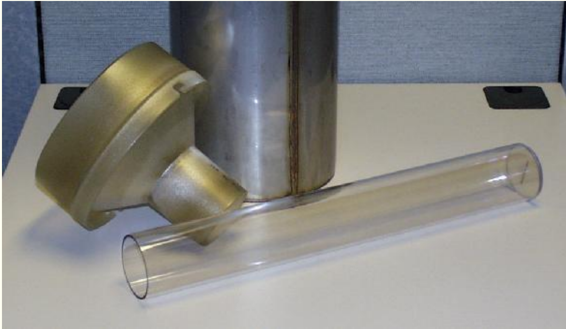
Collector Funnel and Measuring Tube

hammer can be used to remove dents so it will fit over the can. Also, fiberglass collector funnels are easily cracked or broken, if dropped.