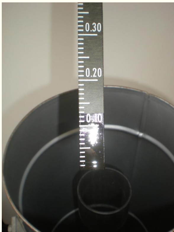
Observation Taken with Measuring Stick

If the rainfall is greater than the measuring tube capacity, water will overflow into the overflow can. The measuring stick should not be used directly in the overflow can. Instead, water from the overflow can should be poured into an empty measuring tube for measurement with the stick.