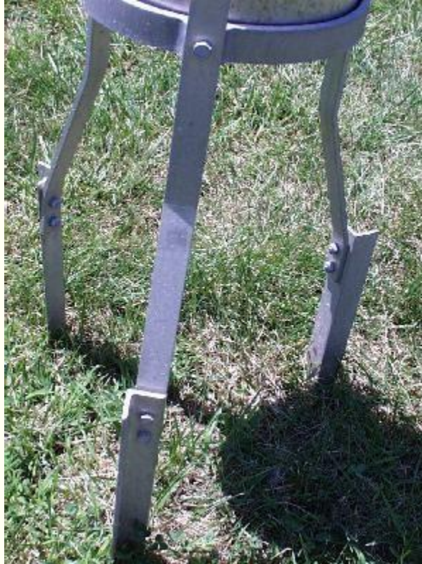
Typical Gage Support

relative to the support can be easily accomplished with a hammer. Once the SRG support is completely installed, the SRG should be inserted into the support and leveled. This is accomplished by gently driving in the appropriate stake(s) to attain a level posture for the 8 inch opening of the SRG.