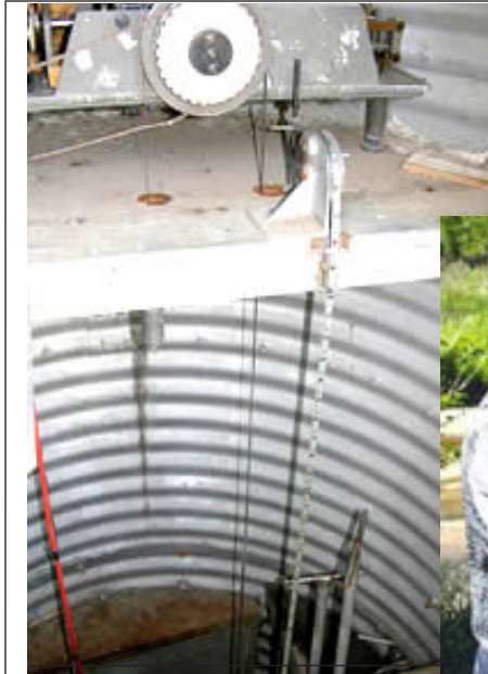
Stilling well in the river gage house, with one of the few remaining tape measuring devices still in operation in Nebraska.

Delmar and Veronica (not pictured) Schoenfish are 25 Year river observers at Cambridge, NE, on the Republican River. Their river readings also provide information on stream flow into Harlan Reservoir. They maintain a slice of history by using some of the oldest equipment NWS owns. Check out the photos below.