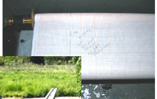
Sutron river gage recording device.

NOAA's National Weather Service The Cooperative Observer 1325 East-West Highway SSMC2, W/OS7 Silver Spring, MD 20910