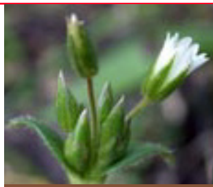
Chickweed.