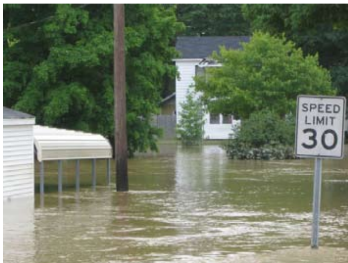
U.S. Geologic Service crews captured this road sign previously posted for cars—not boats!