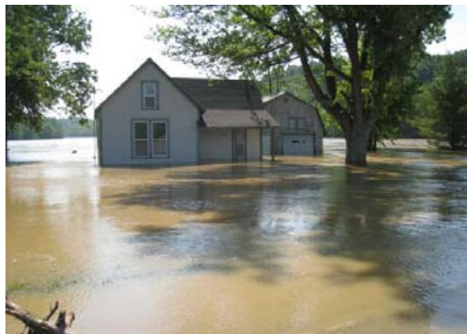
The owners liked their house better near this Indiana River rather than in it.

White River, East Fork White River, and Eel River in central Indiana. Flood water inundated vast areas along these main rivers as it swept into southwest Indiana. In certain areas, the magnitude of destruction is unprecedented in the memory of those alive today.