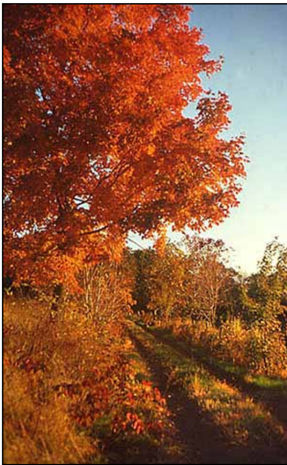
Autumn Trail in the Mohonk Reserve