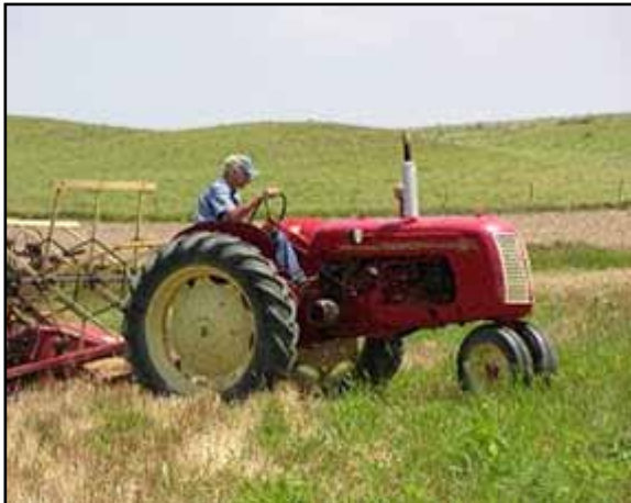
Clifford Roach , age 89, driving and pulling an antique combine. "I didn't expect to live this long, but I'm not going to complain."

Clifford and his sons drive the old combines and harvest what is now 5 acres of wheat—approximately 450 acres was the peak before Clifford retired. After harvesting, Clifford anticipated about 20 bushels of wheat per acre; however, on a good year, one without hail damage, the family could get about 60 bushels of wheat per acre. Unfortunately, thunderstorms rumbled through the Alton area on June 1, causing damage to the Roach farm, which yielded roughly 20 bushels per acre from this harvest event.