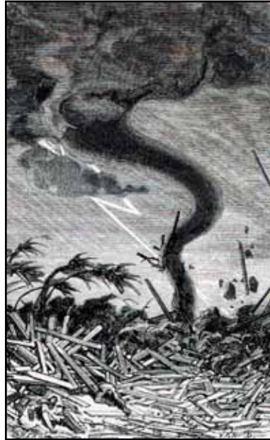
Tornado Over Land: "Histoire des Meteoires", J. Rambosson, 1869. Figure 48, p. 209. NWS Collection: Image Date: 1869

More NWS history in the summer edition of the National Cooperative Observer. ☼