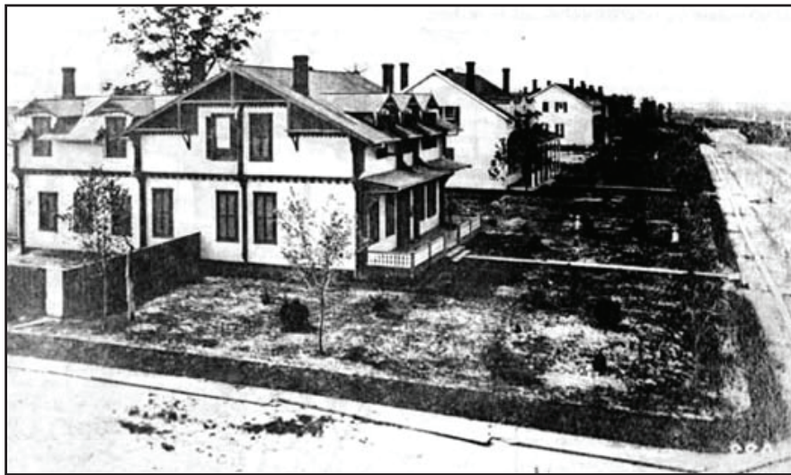
For the education of weather observers (enlisted men) a school of meteorology was added to the existing school of instruction in telegraphy and military signaling located at Fort Myer (then Fort Whipple), in Virginia.

For the education of weather observers (enlisted men) a school of meteorology was added to the existing school of instruction