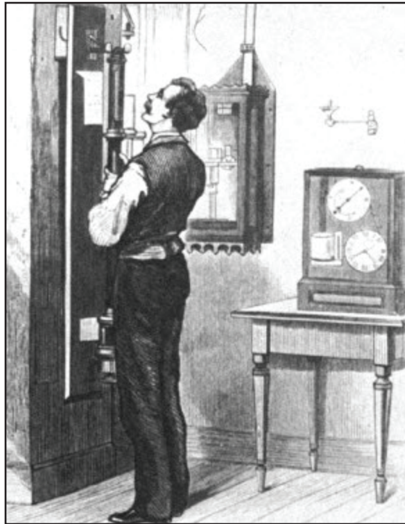
Reading of the Barometer, 1880

This Signal Service office contained a printing department to produce maps and other weather information. In addition, a separate department evaluated weather instruments and another checked weather observations. Finally, to support the various departments and functions of the office, the Service included correspondence and clerical staff.